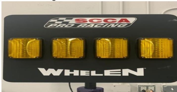
Turn 2 Yellow Light Panel.

NJMP, although a relative flat circuit, requires you to be smooth and have the car balanced through the long high-speed turns – hence no large lifting off the throttle in the turns which will cause the back end of the car to come around on you. This circuit demands that you hit your marks on entry and apex so you don't run out of race track on the exit of the turn. A track like this generally rewards drivers who look far ahead to help them keep smooth with both the steering and throttle. NJMP has generous curbs but don't get in a habit of using them to the outer edge. The drop off will unbalance your car and you'll have a good chance of ending up in the grass. At turn 2, the blind right-hand turn where the track climbs to the apex from turn 1, we've installed a yellow light to help you know when there's a yellow flag situation in that turn.