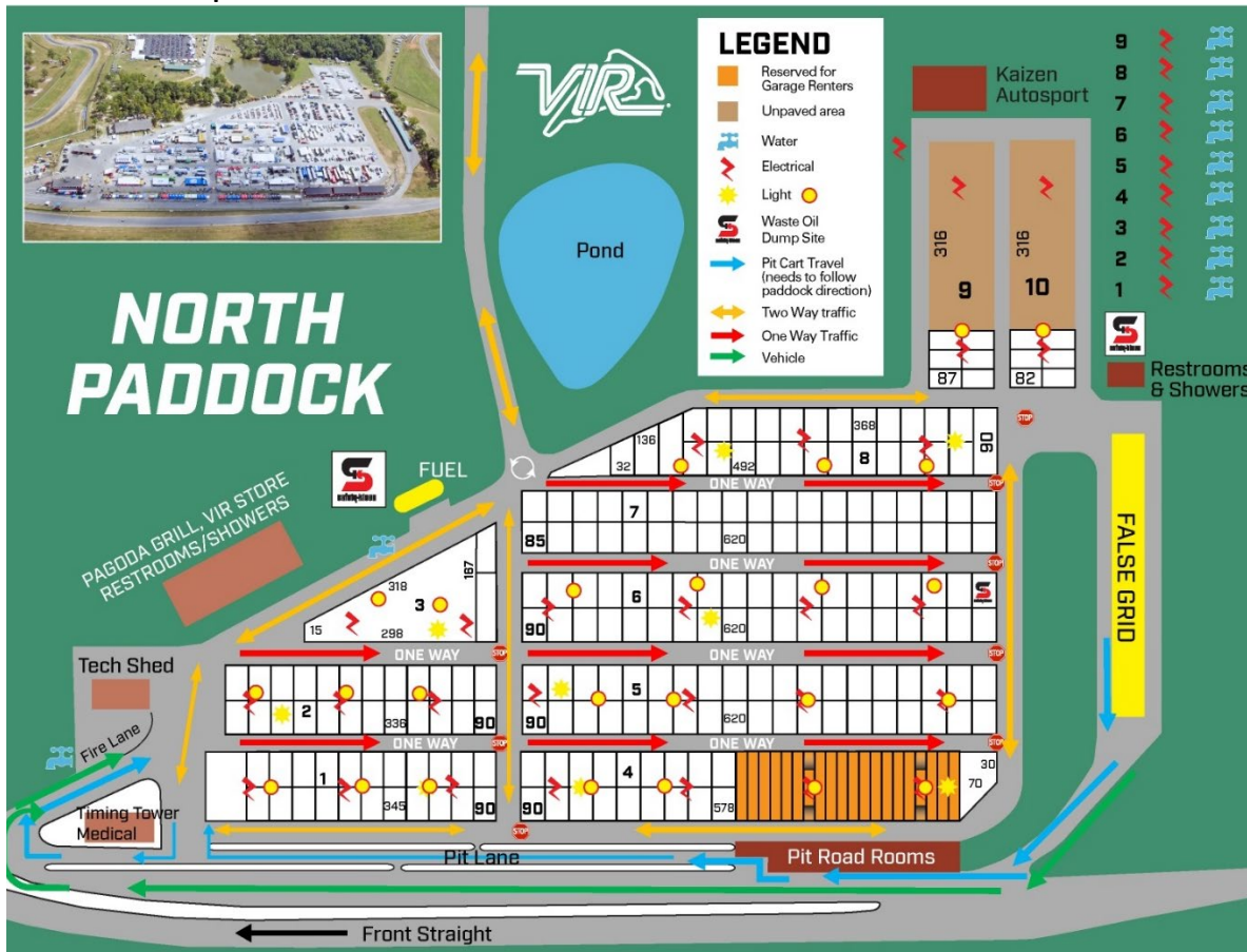
Paddock Map: VIR Paddock Map